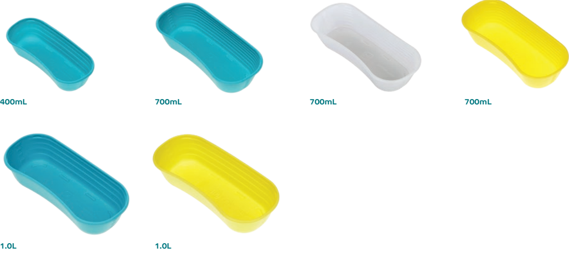
TABLE KEY: (T) Teal, (C) Clear, (Y) Yellow, (GHG) Greenhouse Gas Emissions, (R) Recycle, (D&L) Disinfect & Landfill, (I) Incineration.